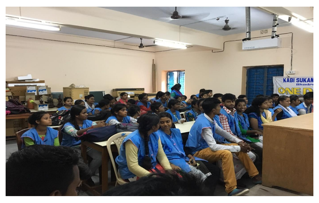
NSS Volunteers are seating over their for Quiz Session