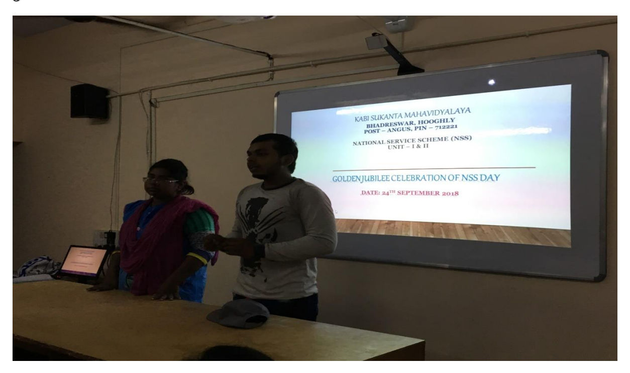
NSS Volunteers are delivering extempore speech