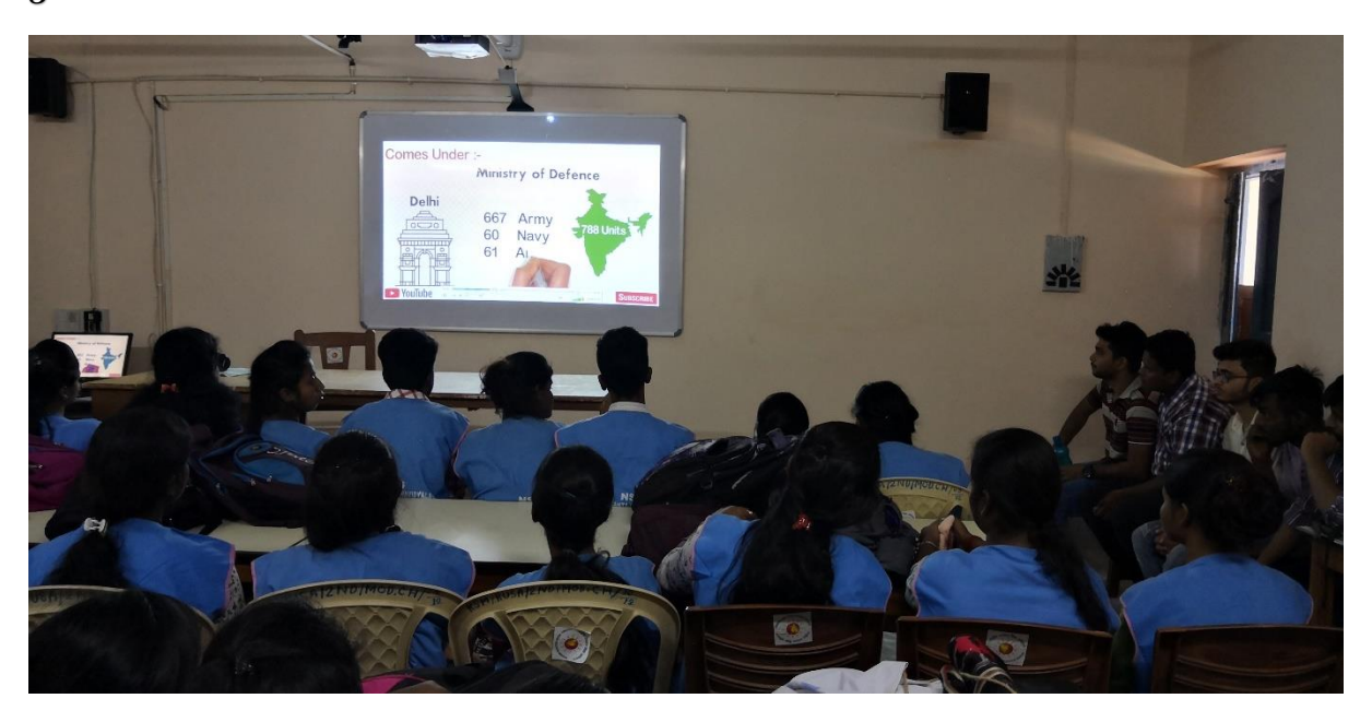
Displaying Information About NCC And NSS through Video Clips