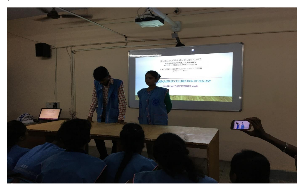
NSS Volunteers are delivering extempore speech